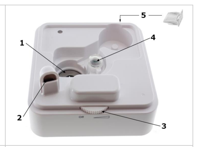
Fig. 2 (Top of Water Tank)