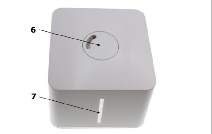
Fig. 3 (Bottom of Water Tank)