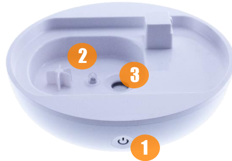
Fig. 2 (Bottom of Water Tank)