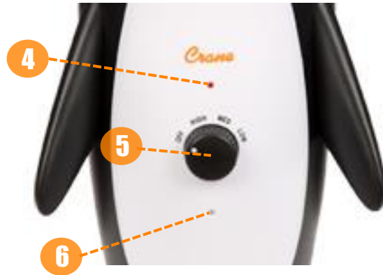
Fig. 3 (Bottom)