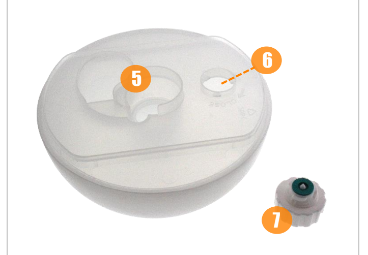
Fig. 3 (Other Parts)