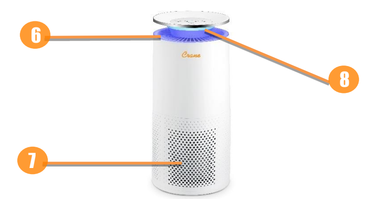
Fig. 3 (Bottom)